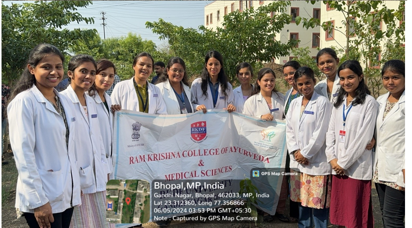
Bhopal, MP, India Gandhi Nagar, Bhopal, 462033, MP, India Lat 23.312360, Long 77.356866 06/05/2024 03:53 PM GMT+05:30