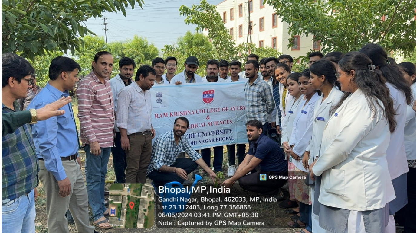
Bhopal,MP,India Gandhi Nagar, Bhopal, 462033, MP, India Lat 23.312403, Long 77.356865 06/05/2024 03:41 PM GMT+05:30