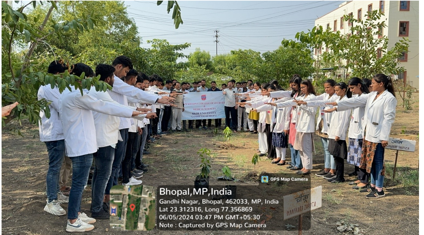
Bhopal, MP, India Gandhi Nagar, Bhopal, 462033, MP, India Lat 23.312316, Long 77.356869 06/05/2024 03:47 PM GMT+05:30 Note : Captured by GPS Map Camera