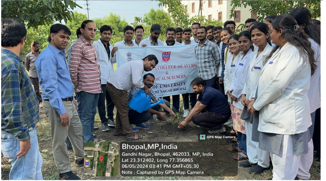
Bhopal,MP,India Gandhi Nagar, Bhopal, 462033, MP, India Lat 23.312402, Long 77.356865 06/05/2024 03:41 PM GMT+05:30 Note : Captured by GPS Map Camera